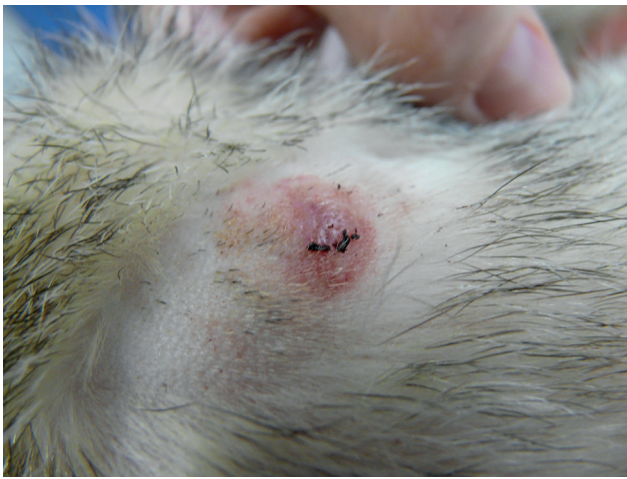
Figure 1: Image of this ferret at presentation showing the raised dermal mass on the head.