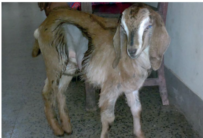
Figure 1: Kid presented after accident with a swelling on the lateral thorax.

The kid was positioned in supine position and a transabdominal approach was resorted to with a concentric incision of 7.5 cm in length caudal to xiphoid and parallel to costal arch on right cranial quadrant of ventral abdomen. Once the abdominal cavity was opened, the hernia was confirmed and the herniated contents included the forestomachs, omentum, spleen, small intestine, liver and gall bladder. An 8 cm long tear was noticed along the right side of diaphragm at the musculotendinous junction. Intra-operatively, ribs 9-11 were found fractured below the costo-chondral junction.