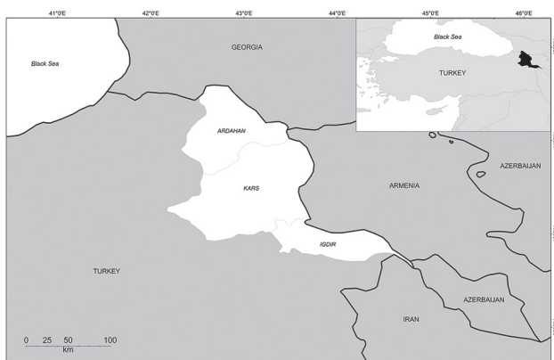
Figure 1: Geographical positioning of the Turkish provinces in which the study was performed.

For detection of AKA virus antibodies a competitive ELISA system (ID VET, Product code: AKAC, France) was used.